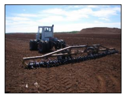
Figure 1c – Harrowing the surface to loosen and fluff the peat moss