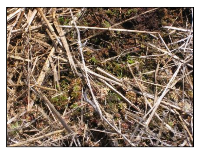
Figure 3c – After two to three years, Sphagnum moss forms nucleus of growth; other plant species take root