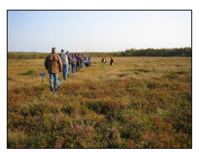
Figure 3d – After ten years, the vegetation cover has been restored and the ecosystem begins the process of peat accumulation